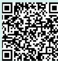
ZOOM LINK QR CODE

MEETING ID: 815 6235 5762 PASSCODE: QPUHP9