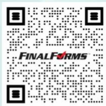
FINAL FORMS QR CODE

UP-TO-DATE PHYSICALS ARE REQUIRED FOR GRADES 7-8.